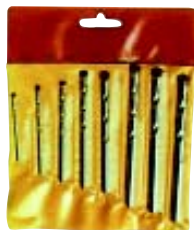
8 piece Masonry Drills 3,4,5,6,7,8,9,10mm in plastic pouch Model No. 340-2020