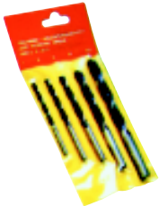
5 piece Wood Bits 4,5,6,8,10mm in plastic pouch Model No. 208-2000