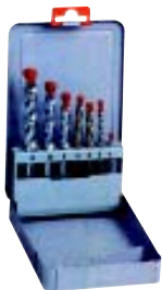
7 piece Masonry Drills 4,5,6,7,8,10,12mm in metal box Model No. 340-2010