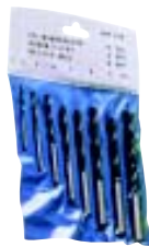
8 piece Wood Bits 3,4,5,6,7,8,9,10mm in plastic pouch Model No. 208-2010