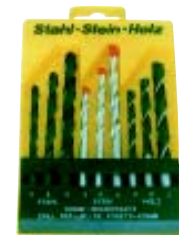
9 piece Drills Combination Set Steel/Masonry/Wood drill 5,6,8mm in plastic box Model No. 201-3428