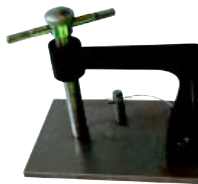
Model No. 318-0003