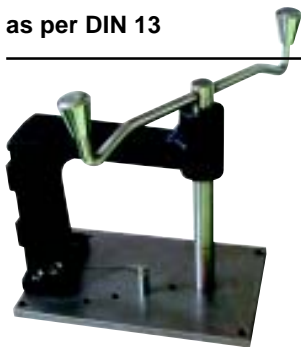
Model No. 318-0007