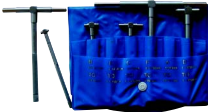
Set Model No. 615-6610